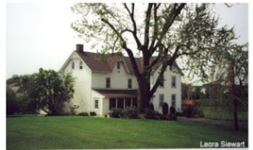
Old photo of the house date unknown

permission was granted to build. The log Meeting House served well. Membership increased so much that it soon became too small and plans were made to build a new and larger one in 1743. Roads had improved by this time and they were able to transport brick for the south end from Newport, Delaware that had been used as ballast in sailing ships. The north end was added in 1790.