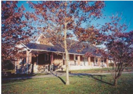
New Garden Meeting House 875 Newark Road