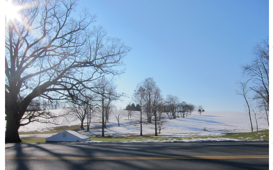
December 2013